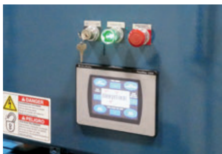
The touchscreen allows full automatic and manual control with one touch. Screens may be customized, password protected, and are designed with alarm, diagnostic and help screens.