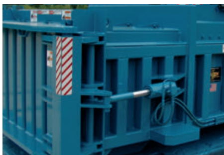
Marathon's Gemini Series balers feature a hydraulic door latch.