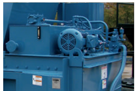
High-efficiency power unit with horsepower limited, pressure compensated piston pump.